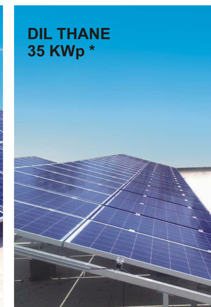
DIL THANE 35 KWp *