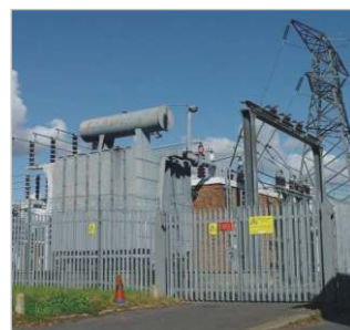
Engineering Procurement & Construction (EPC)