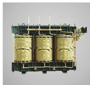
Core Coil Assemblies