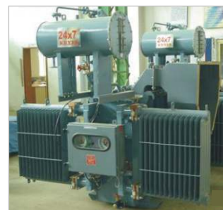
Power & Distribution Transformers