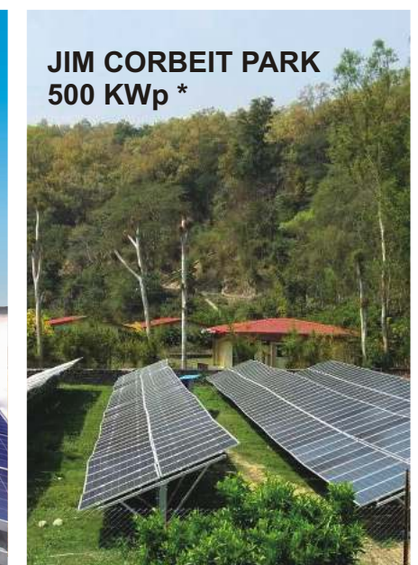
JIM CORBEIT PARK 500 KWp *